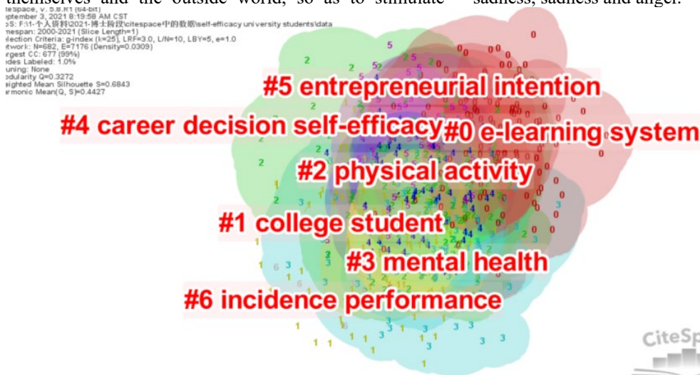
Figure 1 Keywords analysis of self-efficacy

It was first proposed by Bandura (1977), who believed that self-efficacy was territorial and reflected differently in different fields. Later, applied researches on self-efficacy began to appear in various fields, such as psychology, education and organizational behavior. Using CITESpace and SCI and SSCI databases in Web of Science, The author made a visual analysis of The researches on self-efficacy of college students from 2000 to 2021, and presented The keyword analysis of researches on self-efficacy in recent 21 years through Figure 1. 7 types of keywords with the highest frequency were selected to present, and they were ranked in order according to the research heat: Online learning system, college students, psychological activities, mental health, career decision-making self-efficacy, incidence performance, entrepreneurial intention, it can be seen that the research hotspots are in the field of education, mental health and occupation. In terms of education alone, Zhou Zongkui (2007) pointed out that academic self-efficacy refers to students' subjective judgment on whether they are capable of completing learning tasks, controlling learning behaviors and achieving learning goals. Based on The existing research results, The author improved students' subjective judgment ability to control learning behaviors and achieve learning goals through experiential thematic group activities in The interaction between happiness, sadness, sadness and anger.